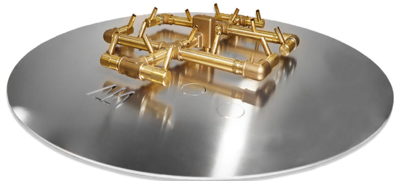
CFB180 on Circular Plate

Mercury Ignition System™ and Platinum Ignition System™ are trademarks owned by and used with permission from Catalyst Electronics, LLC.