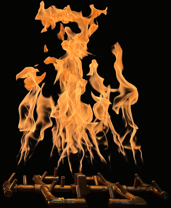
CFB180 CROSSFIRE ® Brass Burner with 180K BTUs