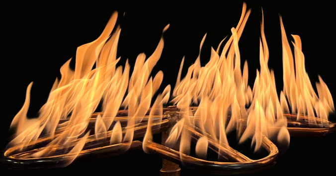
Competitor Burner with 180K BTUs

SUPERIOR DESIGN. SUPERIOR PERFORMANCE. SUPERIOR FIRE FEATURE SYSTEMS.