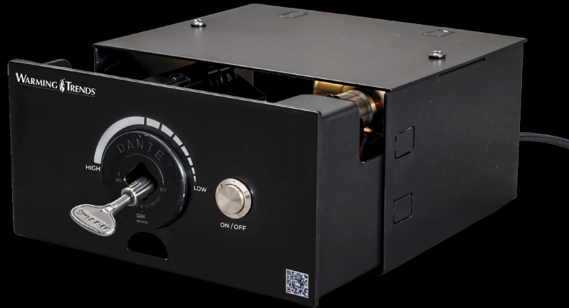
Battery-powered or direct wire options

The Carbon delivers reliable, low-voltage automatic ignition at an exceptional value.